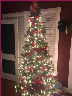
Larry's Christmas Tree.