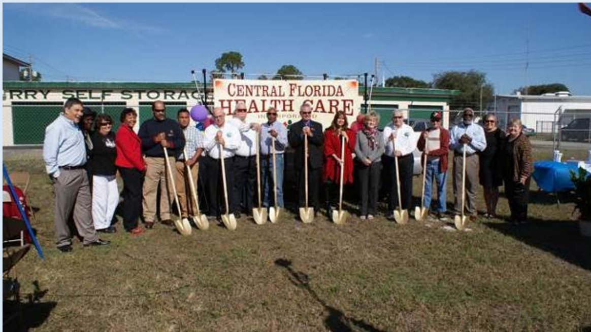
CFHC breaks ground in Mulberry (Polk County)

Central Florida Health Care has added two new sites--one in Mulberry and one in Hardee-- all within the first quarter of the year. Their Lakeland practice moved from the old Parker Street address to a new one on Missouri Avenue.