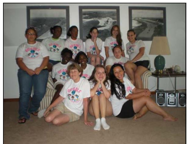
Highlands County Go Girls and their leaders take a moment to pose for a group shot during an education session.