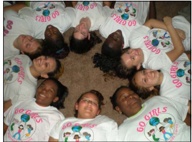
Go Girls is a 16 hour program that provides girls with skills to be a strong, successful young woman.

Esteem and is a 16 hour course that focuses specifically on teen pregnancy prevention but also includes topics on body image, peer pressure, how to avoid risky behaviors and other similar topics that positively impact the girls' futures. Staff are getting ready for the start of a new school year and Go Girls programs are expected to begin again in September. Staff will also be conducting in class education for all 7th, 8th, and 9th grade students. Staff have attended numerous trainings over the summer months and are preparing for the upcoming school year. The Network would like to thank the Central Florida Area Health Education Center for their generous contribution of over $10,000 in Baby Think It Over simulator dolls and supplies. Additionally they have provided training to staff on smoking prevention and cessation education for youth. These teen pregnancy prevention programs would not be successful if it wasn't for the support and commitment from the Highlands, Hardee, and DeSoto County school boards, schools, county health departments and federally qualified health centers, Teen Pregnancy Prevention Coalition members, area health education centers, and the in kind donations from local businesses and organizations. If you are interested in more information on programs in Highlands, Hardee or DeSoto Counties, or would like to volunteer please call 863-452-6530.