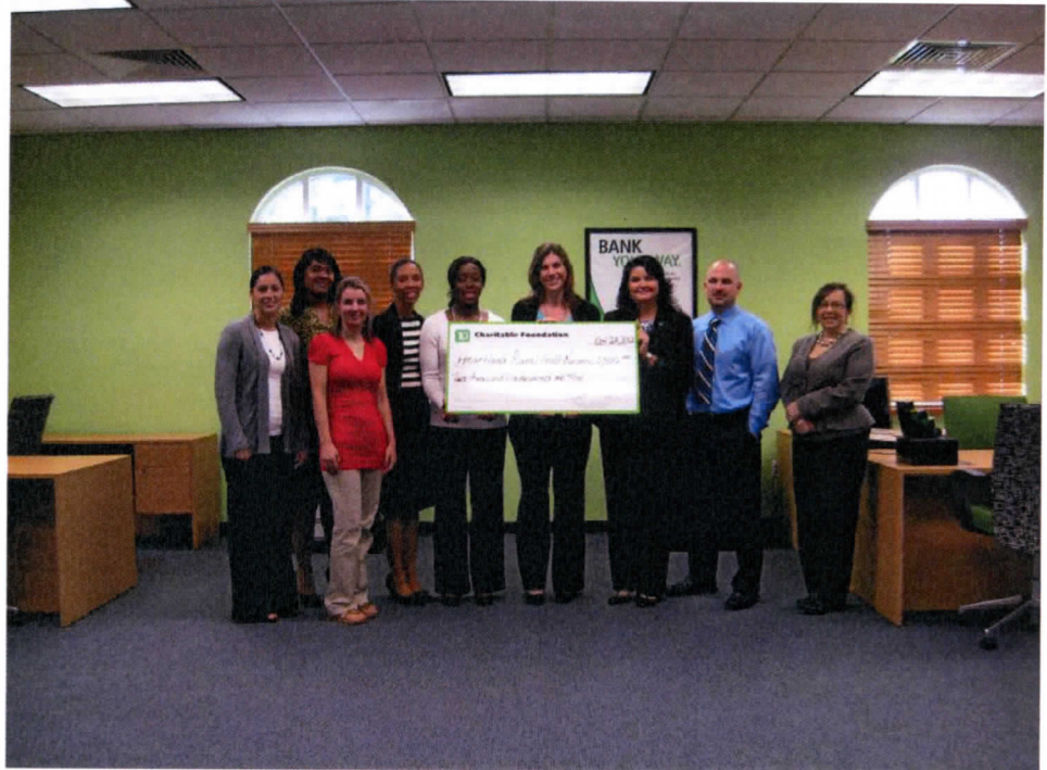
Network Staff Recently Accepted a $2,500 Donation from the TD Charitable Foundation to support their SNAP program.

A staunch commitment to active involvement in the local community is a vital element of the TD Bank philosophy. TD Bank, America's Most Convenient Bank® and the TD Charitable Foundation provide financial and other support to affordable housing initiatives, financial literacy and education and the environment, many of which focus on improving the welfare of children and families.